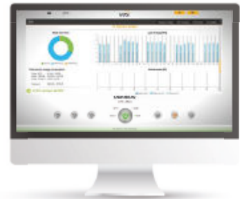
Energy Use & Savings